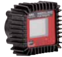
635190-X Order protective boot 74066 separately.